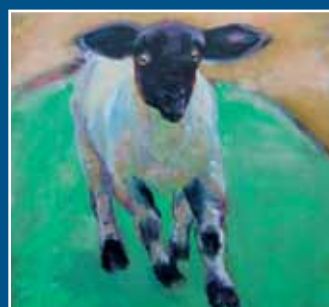
36 Lois Sykes