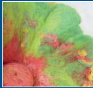
17 Natasha Smart