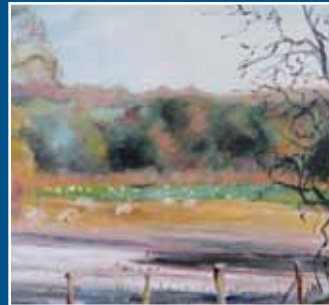
25 Virginia Griffith-Jones