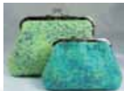
16 ANDREW GRIFFITHS Wood 17 NATASHA SMART Textiles, Felt POST CODE: RH8 9JJ