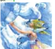
32 GAIL REDWARD Mixed Media • Painting 33 ROBBIE SCANDRETT Mixed Media • Painting 34 CATHY BIRD Mixed Media • Painting POST CODE: TN8 7AU