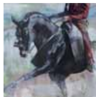
36 LOIS SYKES Painting 37 SALLY MARTIN Equestrian art POST CODE: RH7 6NH