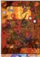
15 ANNE MCCARTNEY Textiles POST CODE: RH8 0DW