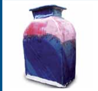
20 Sheila Parish