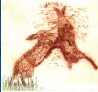
19 Simon Held