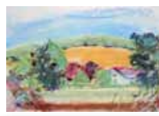
25 VIRGINIA GRIFFITH-JONES Painting POST CODE: TN8 6NB