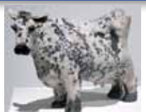
26 JO WOOLTORTON Ceramics • Painting Furniture POST CODE: TN8 5DY