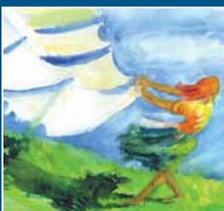
34 Cathy Bird